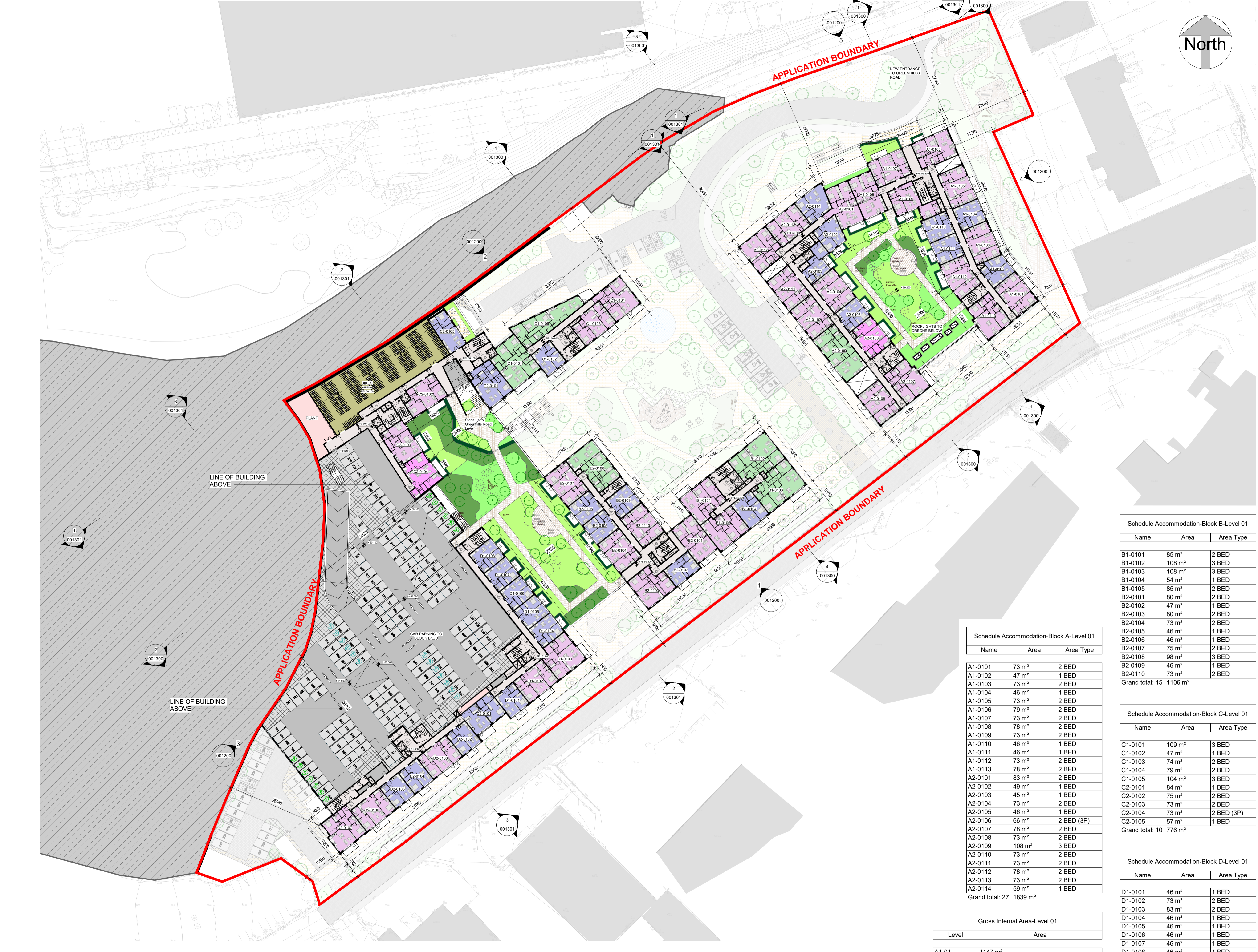
Schedule Accommodation-Block B-Level 01

No.1 Sarsfield Quay, Dublin 7, D07 R9FH t: 01 518 0170 e: admin@cwoarchitects.ie Dublin 1 Cork 1 Galway 1 London 1 UK & Europe + www.cwoarchitects.ie